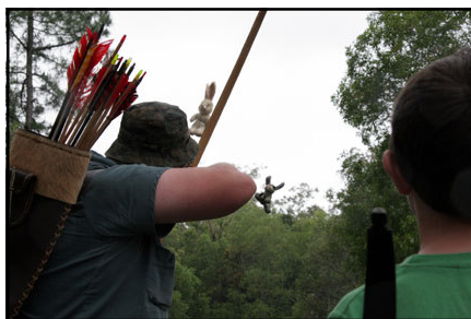
Is it a bird, is it a plane? Nooo...its a.....rabbit!!!