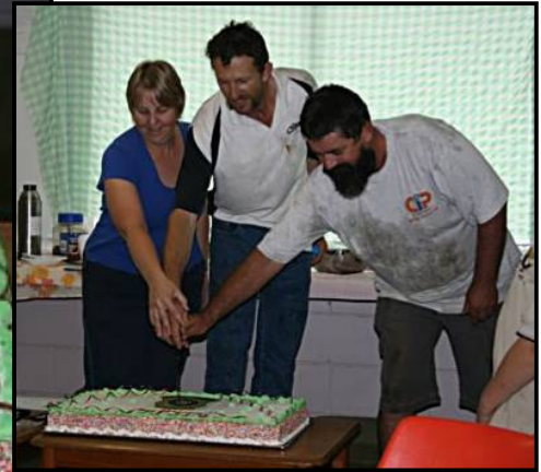
Caboolture Bowmen celebrated 20 years at Murrenbong